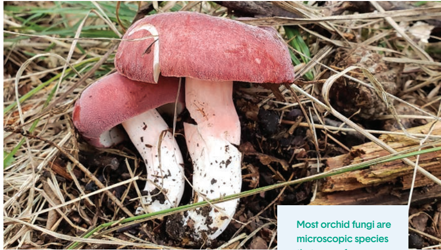
Most orchid fungi are microscopic species that never form mushrooms, but this brittlegill mushroom ( Russula sp.) is an exception.

The germination conundrum leads to the current frontier in orchid science: the role of fungi in orchid reproduction and sustenance. Fungi are thread-like microorganisms that live in the soil. Mushrooms that poke through leaf litter in the early fall are only the fruits of a fungus, a tiny part of a vast underground network that decomposes dead plant matter and relocates water and minerals. Plants and fungi sometimes come together to form specialized structures, called mycorrhizae (“fungal roots”) to share these resources. The plant receives water and minerals from the fungus, and the fungus receives sugars that the plant has created by photosynthesis.