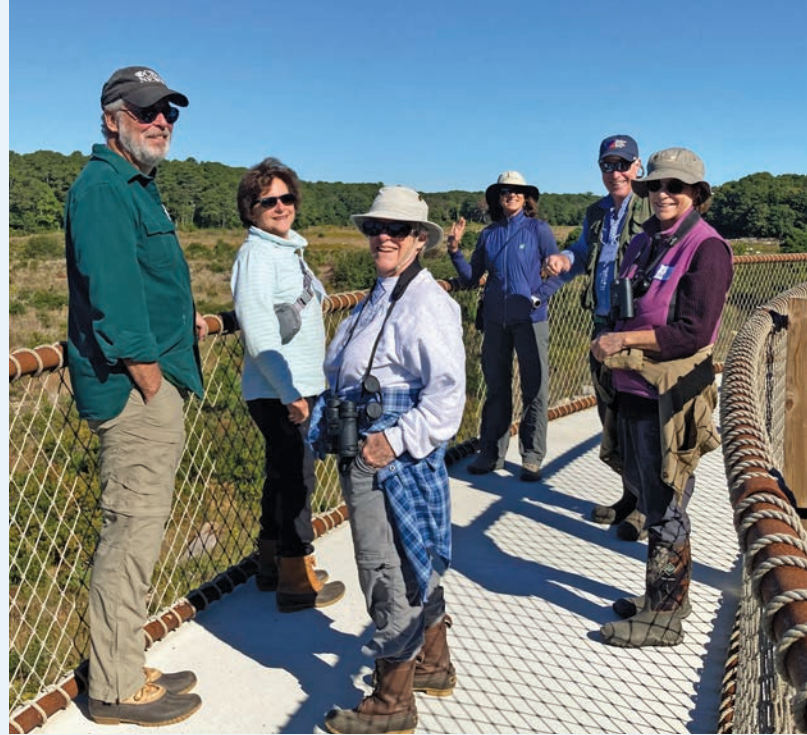
Exploring the wetlands along the Coonamessett River as part of our 2022 Behind-the-Scenes Tour, the Conservation Circle examined native wild flower plots established from seed collected by Native Plant Trust as part of a federally funded restoration project in the wake of Hurricane Sandy.

Thank you to everyone who understands that plants are the cornerstones of our planet and whose financial support has helped conserve and promote New England’s native plants. We especially want to recognize those of you who have made Native Plant Trust one of your philanthropic priorities.