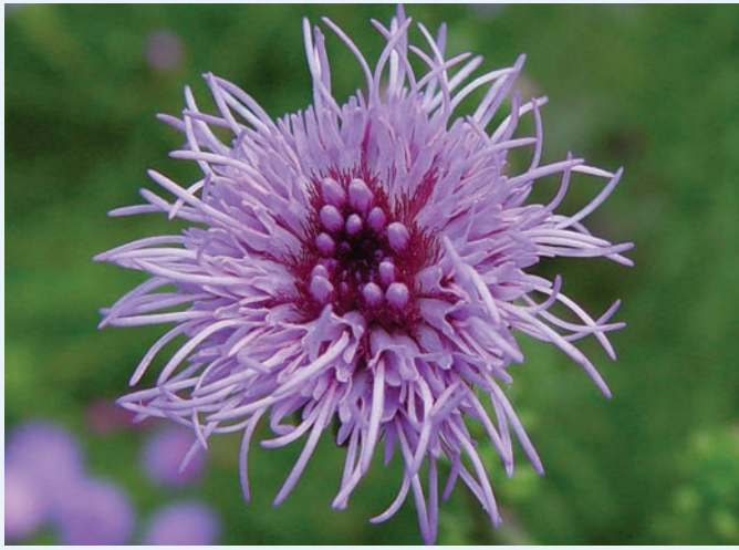
The Seed Ark Endowment Challenge Match helps preserve forever the genetic material of our region's most endangered native plants. Thank you to everyone who has taken part in the challenge in its first four years. 2023 will be the final year of the match so please support while your gift can be doubled! Northern blazing star ( Liatris novae-angliae)