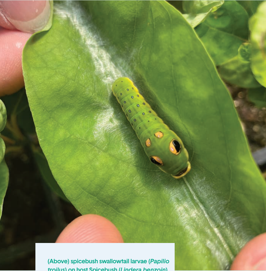
(Above) spicebush swallowtail larvae ( Papilio troilus ) on host Spicebush ( Lindera benzoin ) seedlings in the nursery