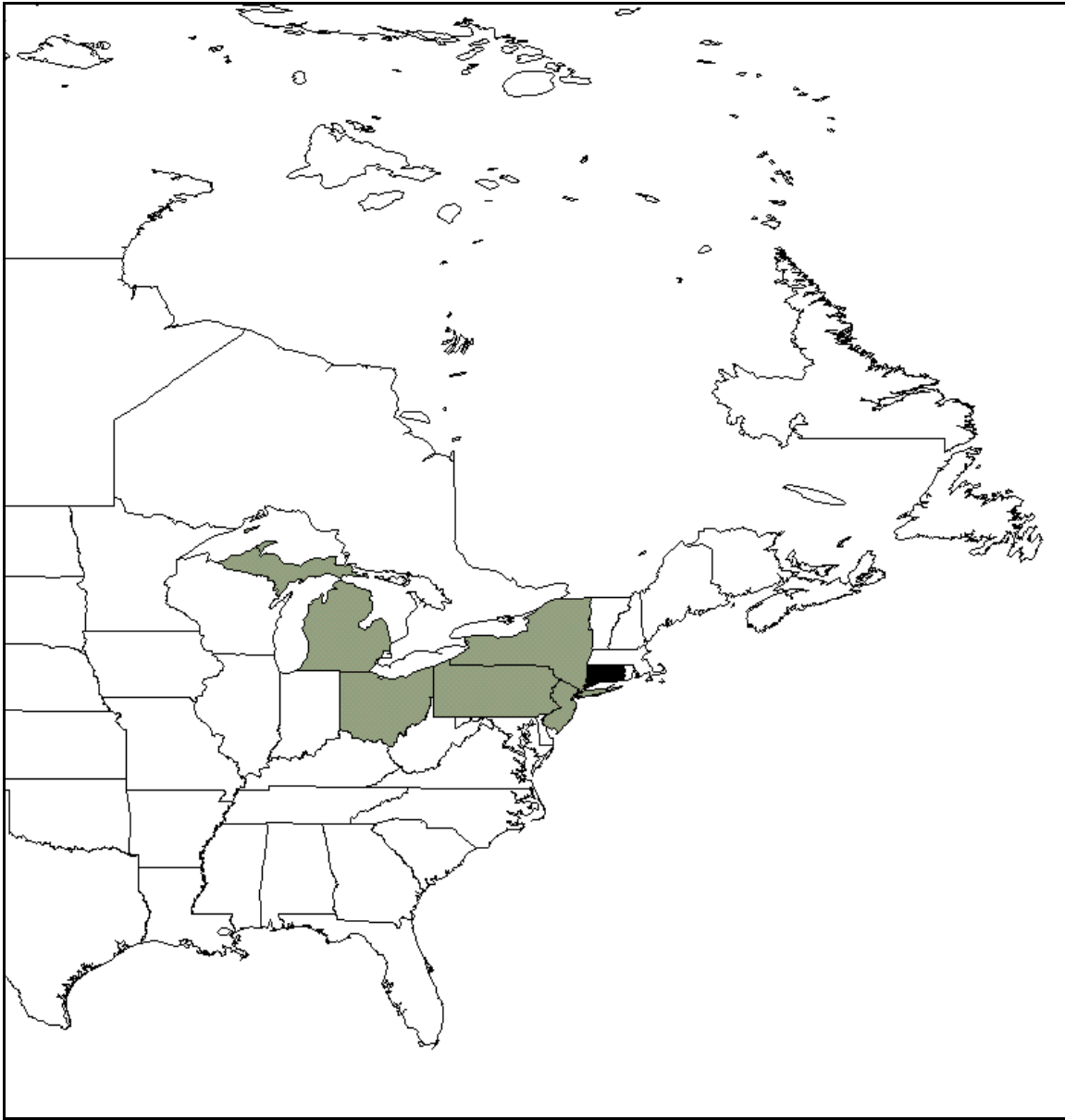
Figure 1. Extant occurrences of Trollius laxus in North America. Gray-shaded states have 1-5 or an unspecified number of occurrences (see Table 2), while states in black (Connecticut) has more than 5 occurrences.