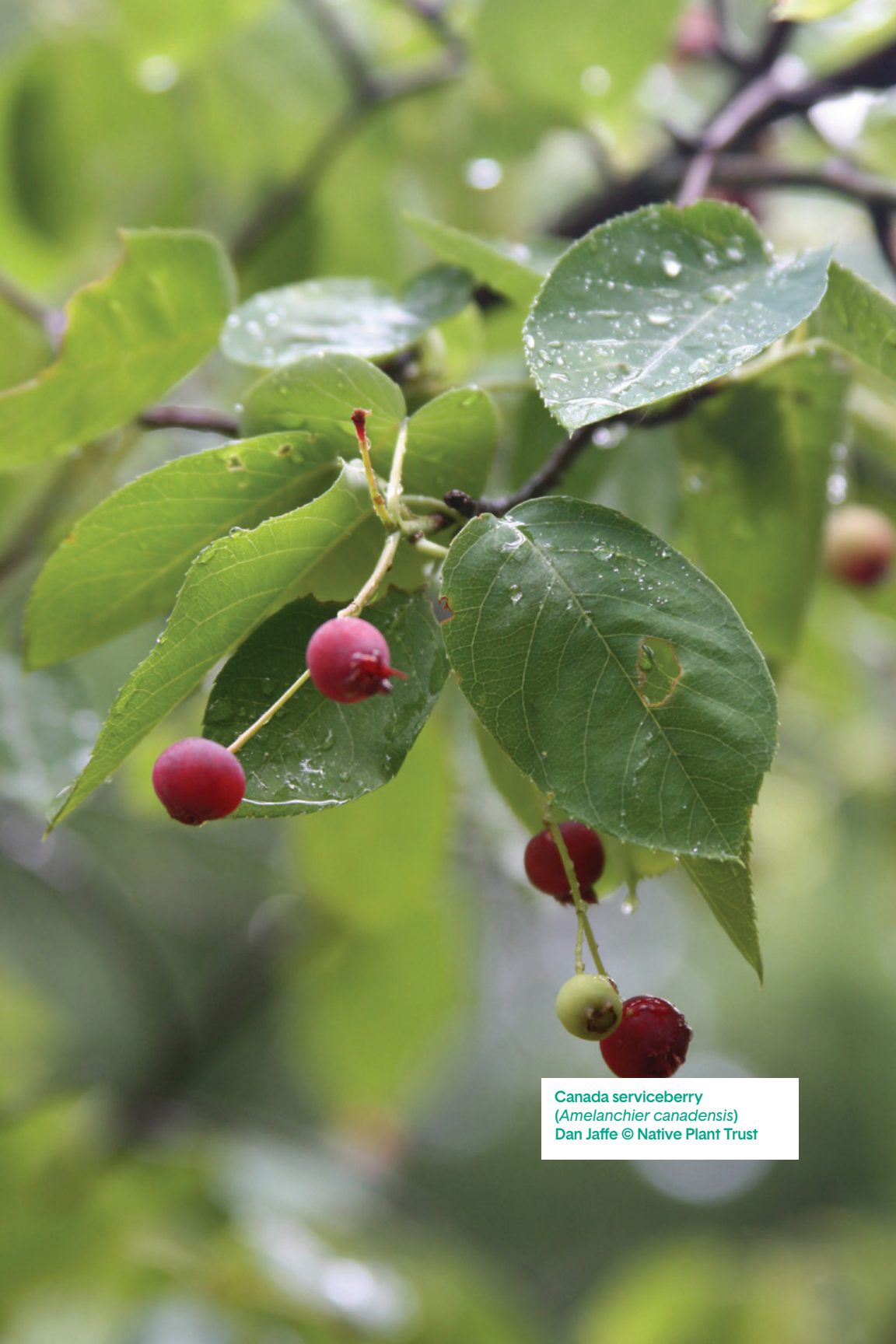
Canada serviceberry ( Amelanchier canadensis ) Dan Jaffe © Native Plant Trust