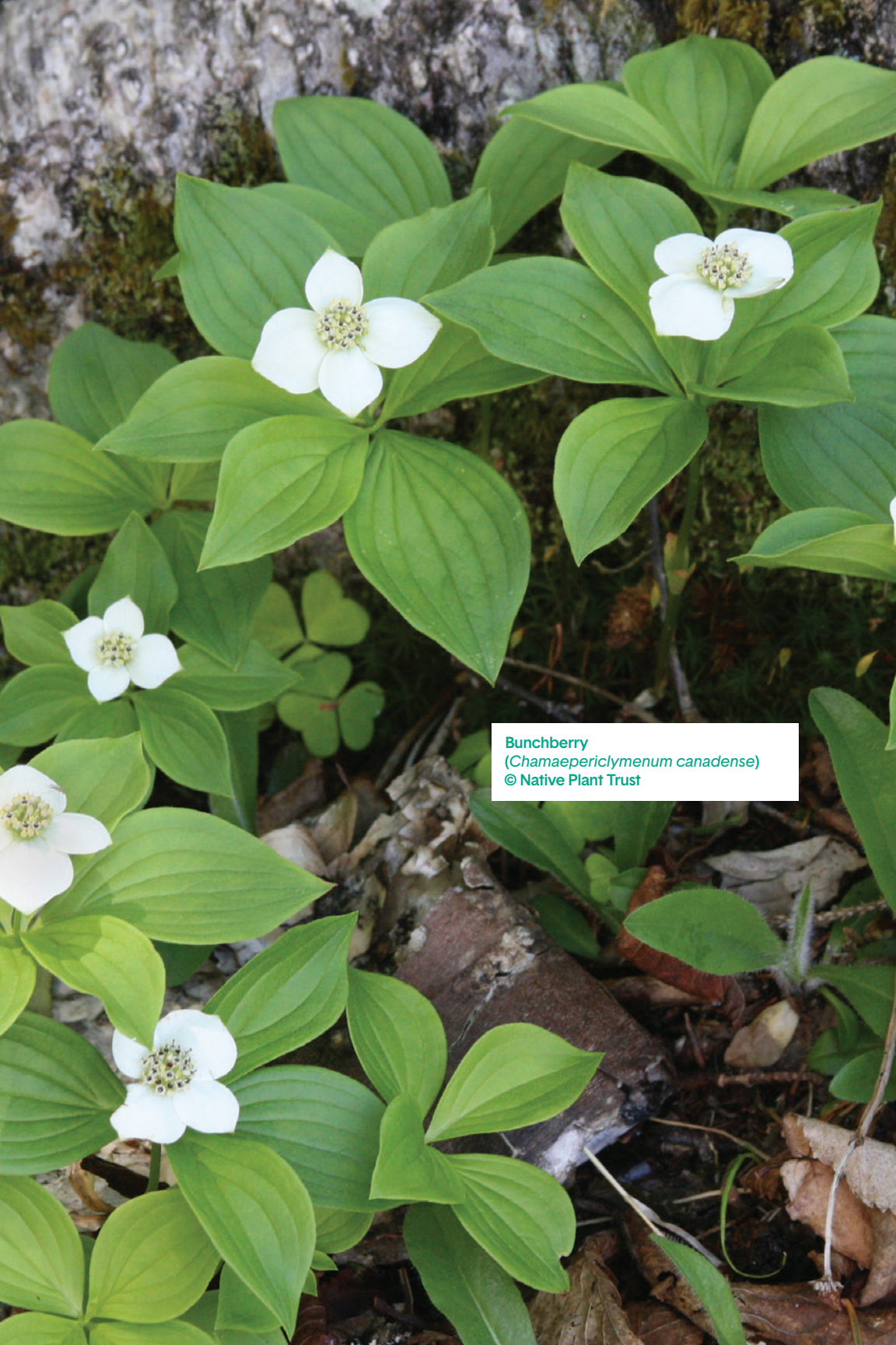
Bunchberry ( Chamaepericlymenum canadense )