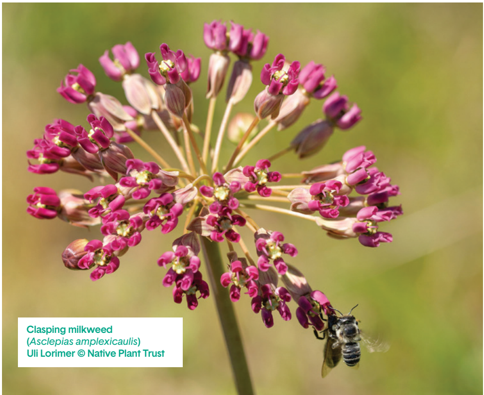
Clasp milkweed ( Asclepias amplexicaulis )

Fee: Free of charge with Garden admission