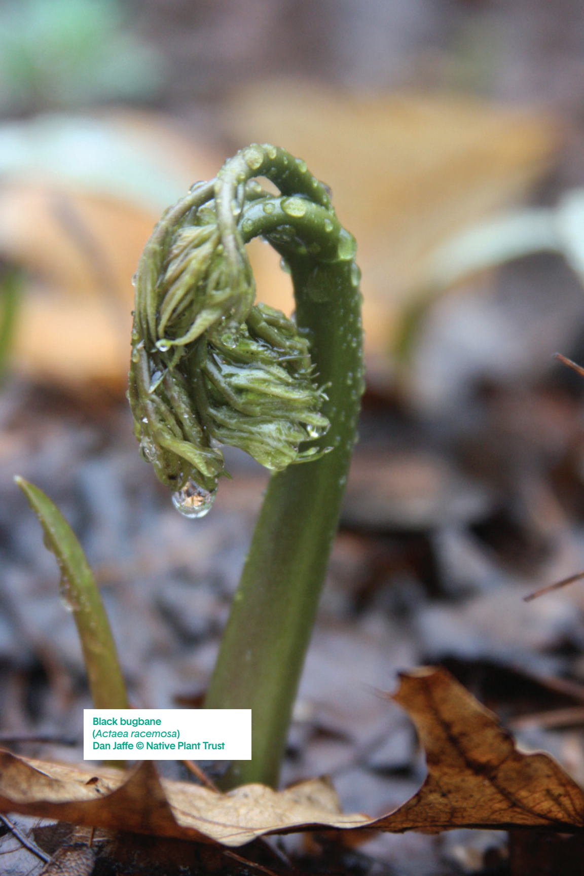
Black bugbane ( Actaea racemosa ) Dan Jaffe © Native Plant Trust